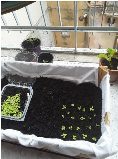
Growing basil on the balcony.

I tried to take the good parts for myself, getting used to the things I can not change and change the bad pieces as much as possible.