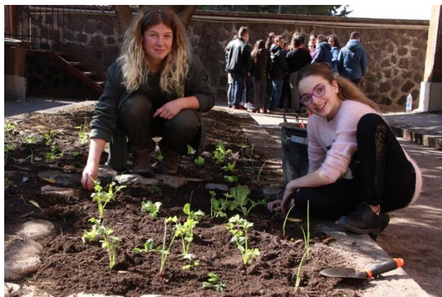
The recently realized school garden of Bronte.

From my first workday on I was involved in the ongoing project “Frutti per la biosfera”. This environmental education activity focuses on climate change and possible actions that aim to reduce or combat CO 2 emissions in the long term, related to agriculture and sustainable food. The association Giacche Verdi Bronte realises this with the support of the Manfred-Hermesen-Stiftung foundation and the support of the German Ministry BMU with the European Climate Initiative (EUKI). Together with the other volunteers and workers of Giacche Verdi, I went to the middle school of