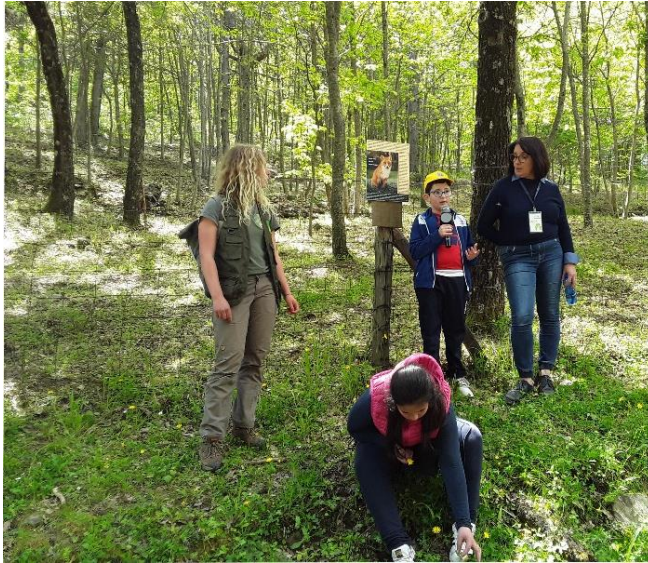
A little ranger talking about the fox on the "Bufo Bufo"- path.

Environmental education projects such as "piccole guide" can contribute to achieve this goal. The little rangers are a group of 9 to 14-year-old children in the village Santa Domenica Vittoria who meet in their spare time to inspire other children of their age with the local nature. They not only explain the flora and fauna of the Nebrodi Mountains, but also the cultural highlights such as old water mills and traditional legends. To open the "Bufo Bufo"- path, the first environmental education path in this area, we organised a tour where the "piccole guide" talk about the natural specialities in front of their classmates and other children.