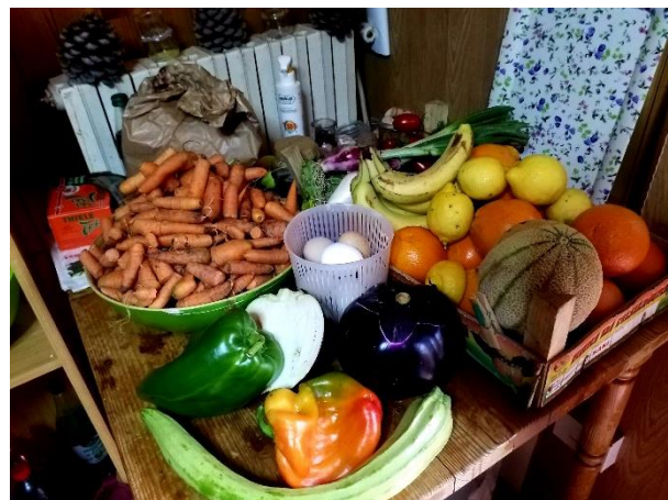
Left: Selina and Pheline (Germany) return from the market. Right: Mostly local and regional fruits and vegetables.