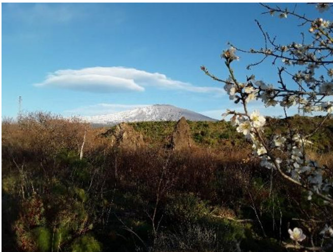
The children's forest "Bosco brignolo" in Spring.

Moreover, we always had to write reports about our activities in this project, we had to take pictures and create posters about nature educational topics. Through this I evolved my writing and creative working skills.