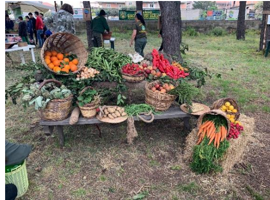
Left: Self-made sign for our market. Middle: Selina (Germany) at the planting station. Right: Local fruits and vegetables.

Moreover, we always had to write reports about our activities in this project, we had to take pictures and create posters about nature educational topics. Through this I evolved my writing and creative working skills.