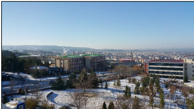
COMU, Çanakkale, Turkey

This was my first experience to abroad. Even I don't travel much outside of my hometown because of my studying. I thought it will be a good chance to work in environment and also a good opportunity to clear my head. One week later, I prepared all paper stuff and planned everything.