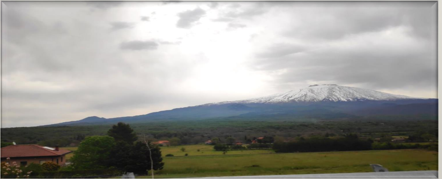
Etna from Bronte-Randazzo road, Bronte, Sicily, Italy