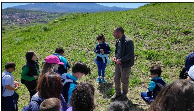
Giacche Verdi team in one of the Garden with children, Maletto, Sicily, Italy

Sometimes, we visited some gardens with the children and made little lessons in the garden. I think this is the best way to teach the children about the nature. Seeing the plants and learning something from the local owners of the garden helps visualize and give the different perspective.