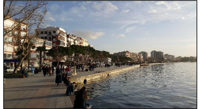
City Center of Çanakkale, Turkey

Before I come here, I live in Mersin which is placed in Mediterranean part of the Turkey. I was studying Molecular Biology and Genetics in Çanakkale 18 Mart University (COMU) in Çanakkale. I have always interested in learning and understanding Biology and I wanted to be a Molecular Biologist after I graduate. Generally, I interested in especially Botany, Plant Biotechnology and Plant Genetics. When my association in Turkey tell me about a voluntary organisation – It seemed interesting and when I make search, I realised that Giacche Verdi is suitable for me. I gave my decision in 2 days and directly go back my hometown to prepare.