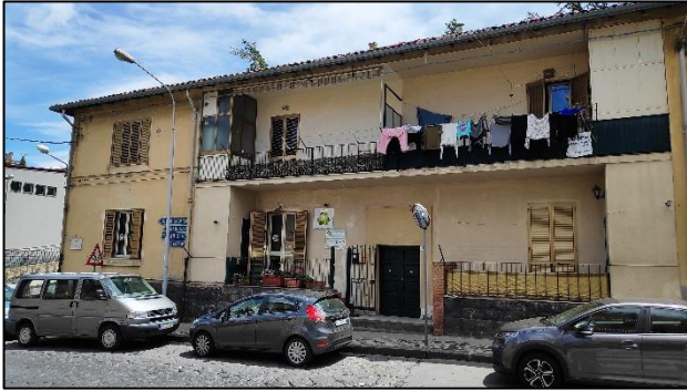
Giacche Verdi Office, Bronte, Sicily, Italy

Giacche Verdi Office is a nice and quiet on the main road of Bronte. Before working, proper clothes (such as hat, t-shirt, vest, jacket, pant, gloves) were given to me. If we didn't have to go to the field, we were staying in the office and did some research about some specific topic for our projects (for example how to abandon plastics, make games for the children etc.) or took care of the office (for instance garden organization, planting and watering the plants, take care of office's dog or cleaning office).