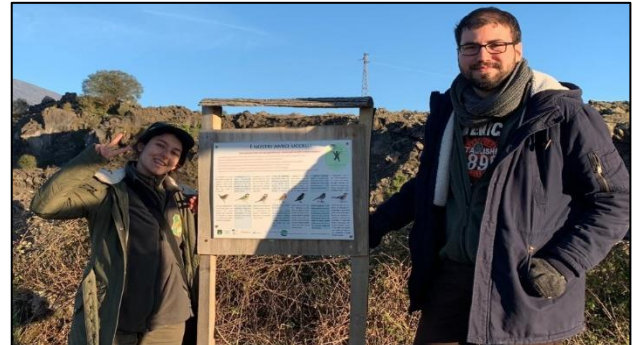
Me and Iris in front of the one of the information board in Bosco Brignolo, Bronte, Sicily, Italy

Brignolo – “il Bosco dei Ragazzi per i Ragazzi” or Bosco Brignolo (Children’s Forest) is a place that previously was a garbage area. It was taken by Giacche Verdi to make a forest. They had planted trees and put some information boards have placed in the place before I have been here. Our aim was to take out garbage, to take care of and clear the area and to crop down a specific plant “Ferla” ( Ferula communis ) in that area. We sometimes worked with the students of a school in Bronte.