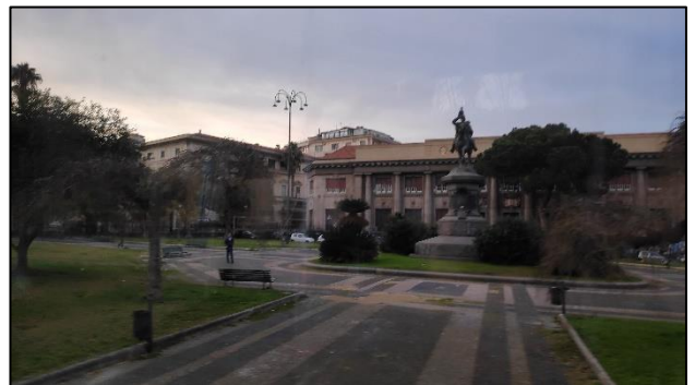
Photos from Catania, Sicily, Italy

When I got here, I didn't know any Italian words. When I managed to go out from airport, I tried to speak English and told them how I can go to Bronte. It was difficult and scary because my telephone was not able to call, to text or use internet. But after an hour, I found some English-speaker at the Central Station in Catania and manage to get a ticket to Bronte. The journey to Bronte was so good and enough to observe some part of the Catania while going.