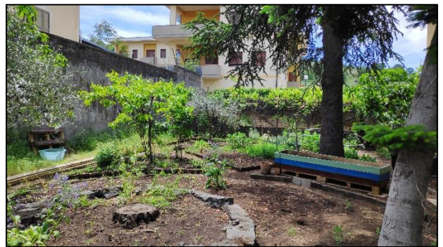
Garden of the Giacche Verdi Office

Giacche Verdi has also a little garden in behind the office. We could plant and make practice for planting and build something for the children or for the garden.